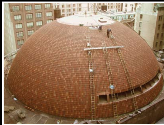
New York City Center Dome, constructed in 1924 with Ludowici Roof Tile.