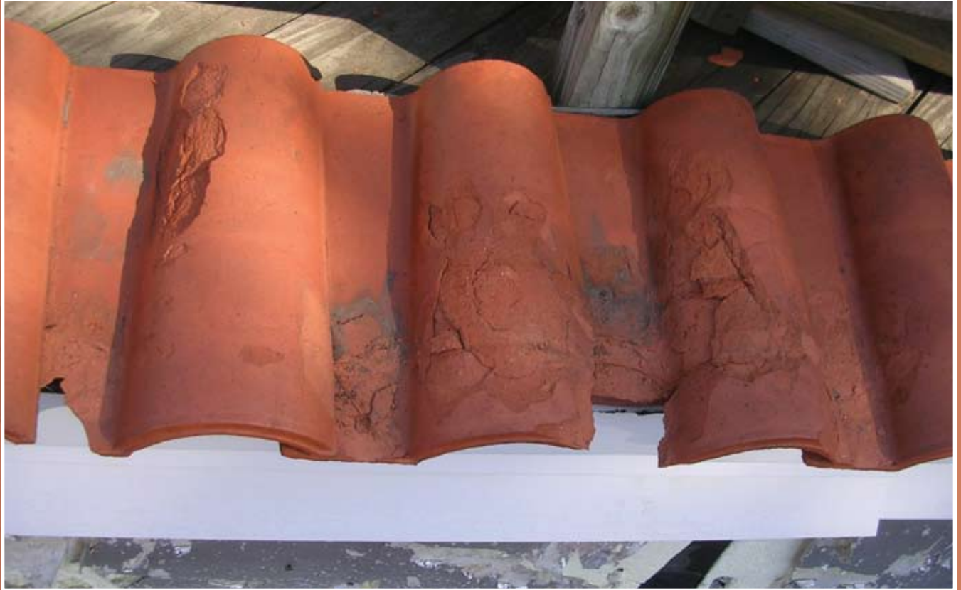
This tile on a New York school was imported from Italy and failed after 8 years.